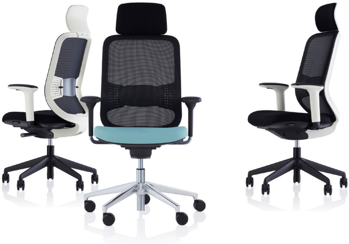
Top - DO-HBA, Bottom - DO-HBHA